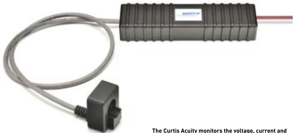
The Curtis Acuity monitors the voltage, current and temperature (with integrated temperature sensor) of a battery to determine accurate state-of-charge, battery warranty status and battery productivity