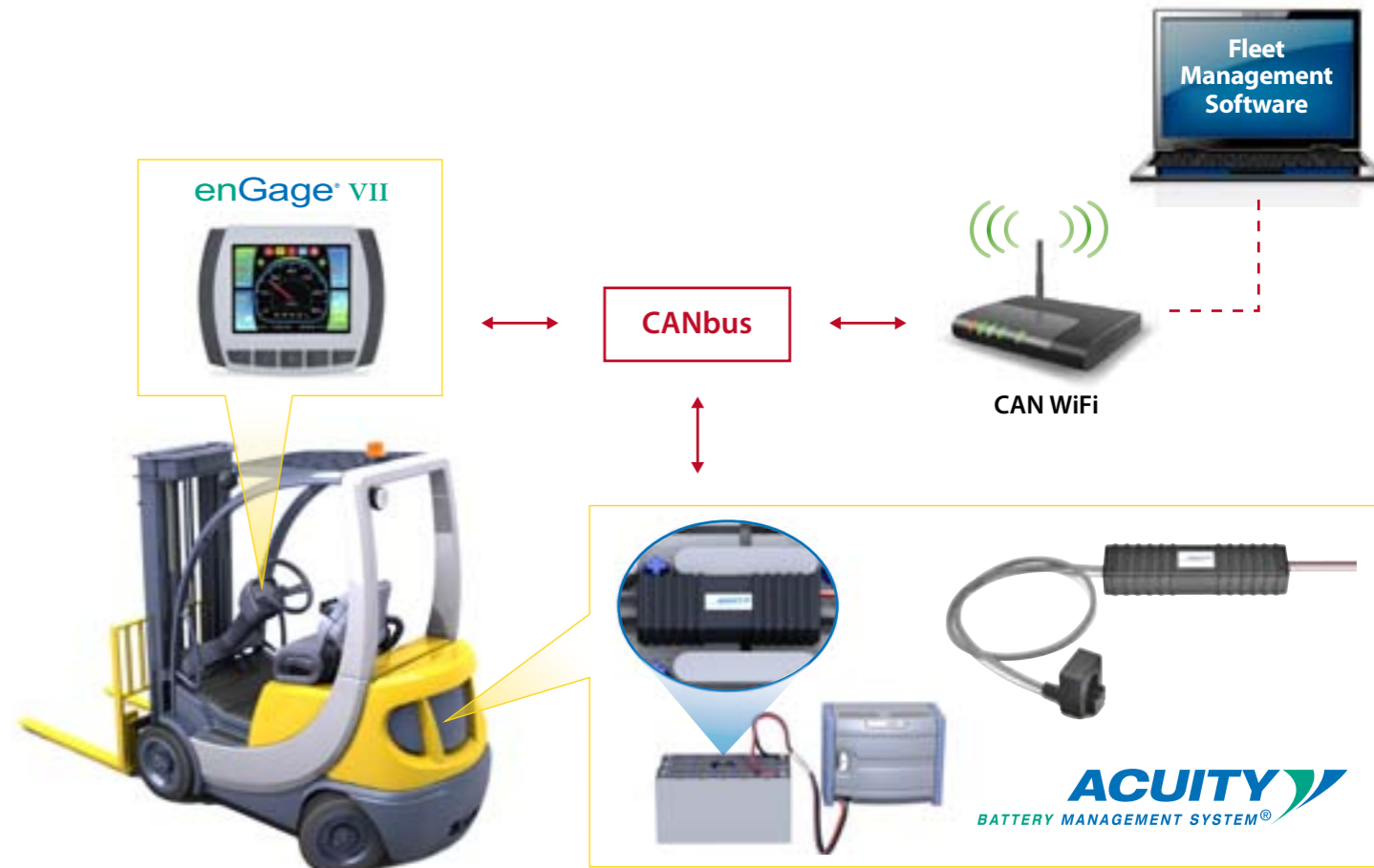
The Curtis Acuity device connects directly to the vehicle battery, where it collects and transmits accurate battery state-of-charge and battery-condition information.

In order to technically solve the problem of a more complex, comprehensive battery reading, a new algorithm was needed. The old maths calculated SOC by integrating the battery voltage over time. As work