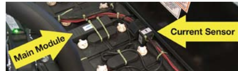
ABOVE: The Curtis Acuity Battery Monitoring System is easy to install. Shown is the Curtis Acuity on the battery of a Class 3 powered pallet truck

Curtis has created a standalone software program – an optional Acu-Set software kit that greatly enhances this process. The kit consists of software and a dongle which allows the Acuity data to be read by a PC. This proprietary software reads the data and translates it into clearly accessible and actionable information.